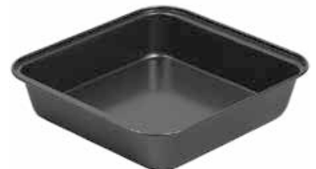
Deep Baking Pan*