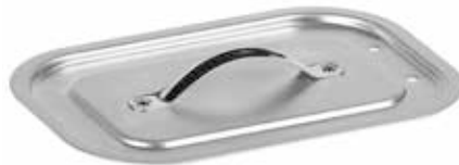
Bread Pan Lid