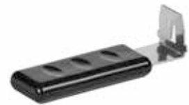
Bread Pan Handle